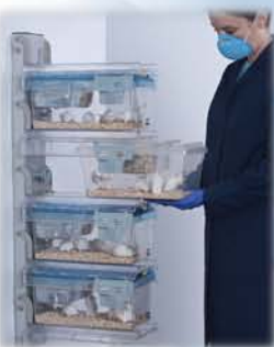
Accepts Super Mouse 750™ and Econo-Cage® Disposable System