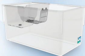
Super Mouse 750™ (75 in 2 floor area)