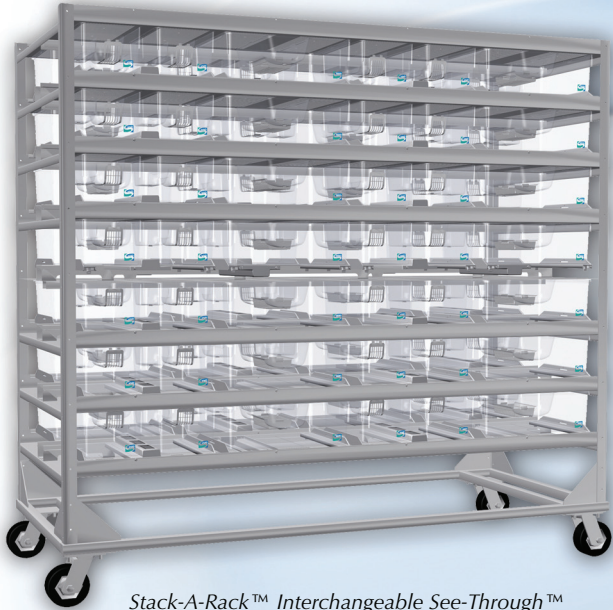
Stack-A-Rack™ Interchangeable See-Through™ Housing Systems meet or exceed ILAR Guide Recommendations for housing rodents.

Stack-A-Rack™ systems provide a variety of ordering and configuration options. To meet various housing density and installation requirements, single-sided and double-sided mobile systems are available. You can order Stack-A-Rack™ unassembled, preassembled or with welded, fixed shelving. Super Mouse 1800™ and Super Mouse 750™ cages accept LifeSpan™ rodent enrichment, providing a stimulating multilevel cage environment. Both cages also accept Micro-Isolator™ Filter Tops, allowing cage inventory to be shared with animals housed in Micro-Isolator™ Systems, for other housing system applications.