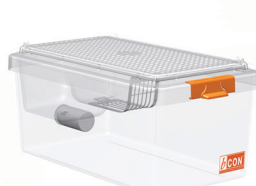
Super Mouse 750™